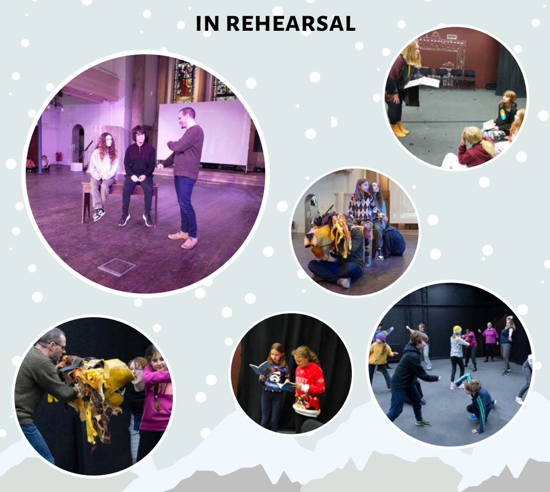
"That ride was perhaps the most wonderful thing that happened to them in Narnia"